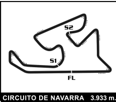
CIRCUITO DE NAVARRA 3.933 m.